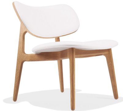
Upholstered Back Pad Fully Upholstered Seat