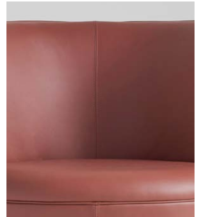
Back Seam Detail - only for chairs with leather