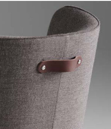
Caster Base Back Detail Standard with Pull Handle