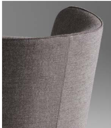
Glide Base Back