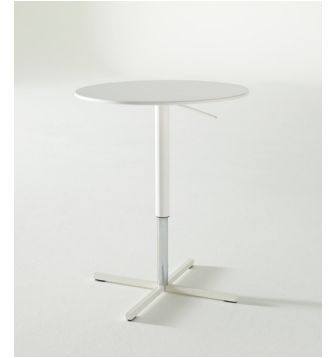
Adjustable Table - Up