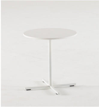
19" Round High Fixed Table