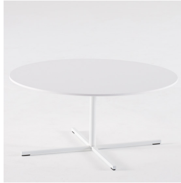
Low fixed table