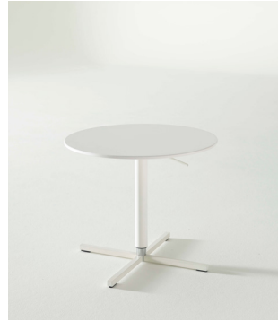
Adjustable Table - Down