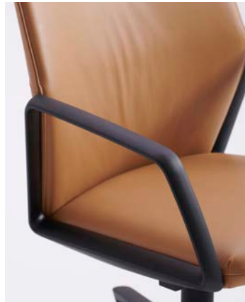
M75-EMA Exposed Metal Arm