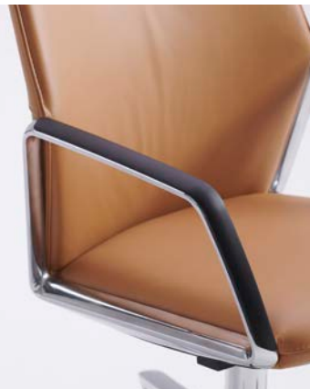
M75-BLAC Black Plastic Arm Cap