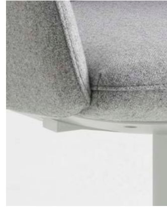
M75-CSP Matte White Seat Pan