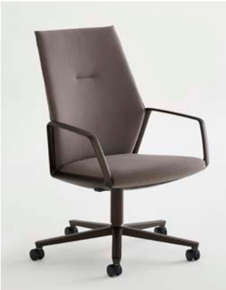
Aluminum / Open Arm