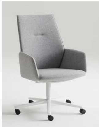
Upholstered / Enclosed Arm