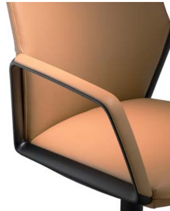
M75-UPHAC Upholstered Arm Cap