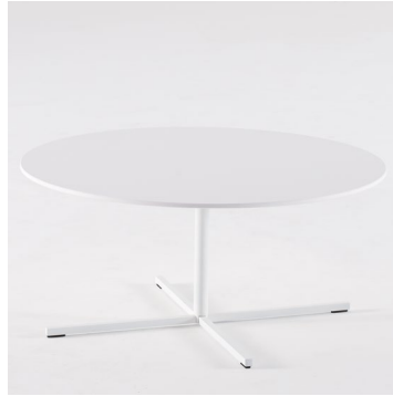
Low fixed table