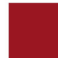
.47 Tomato Red