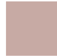
.70 Dusky Rose