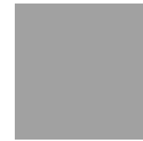
.67 Aluminum Silver