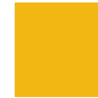
.69 Citrus Yellow