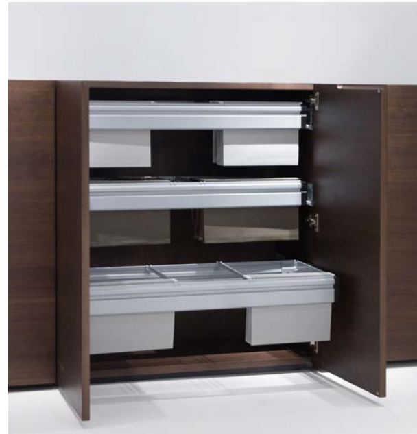
Hanging File Drawer

All Hue cases come standard with a set number of interior shelves, but provide options for additional shelves, box drawers, and hanging file frames. Shelves are finished to match the cases, as are the box drawer fronts. Quantities of interior options vary per unit size, but all cases are available with several interior configurations. Each case and wardrobe also has the option for a door lock.