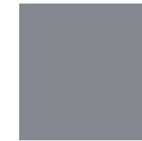
.61 Ice Blue